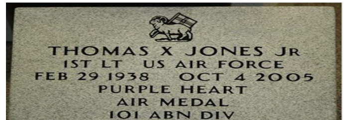
SMALL FLAT GRANITE (L)

This grave marker is 18 inches long, 12 inches wide, and 3 inches thick. Weight is approximately 70 pounds. Variations may occur in stone color.